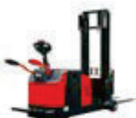
A Series 0.8 - 2.0t Counterbalance Stacker