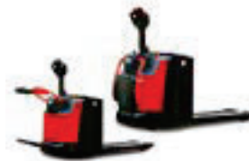
Hi Range 2.0 - 3.0t Powered Pallet Truck