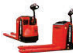
Premium Range 2.0t Powered Pallet Truck