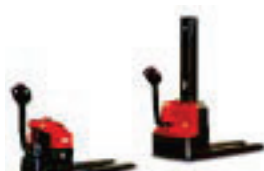
Mini Range 1.5t Powered Pallet Truck 1.0 - 1.2t Pallet Stacker