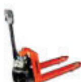
Hand Pallet 1.5 - 1.8t Semi-Electric Hand Pallet Truck