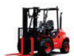
Rough Terrain 2.5 - 3.0t, Diesel