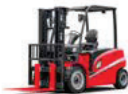
A Series 4.0 - 5.0t, 4 Wheel Electric