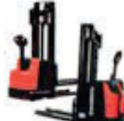
Stacker Range 1.2 - 2.0t Pallet Stacker